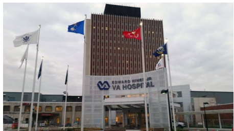
Edward Hines, Jr. V.A. Hospital

RME provided Structural Engineer Services for this renovation. The existing building is a 2 story structure with a partial basement.