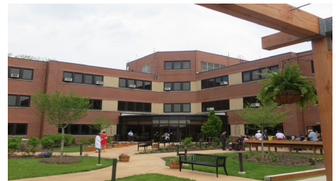
North Chicago VA Medical Center IDIQ

RME was the Structural Engineer for this project. The new Pavilion will house new administration offices, visitation areas, staff facilities, a dining area, patient treatment area, exercise room, security area, nurses station, and a mechanical penthouse.