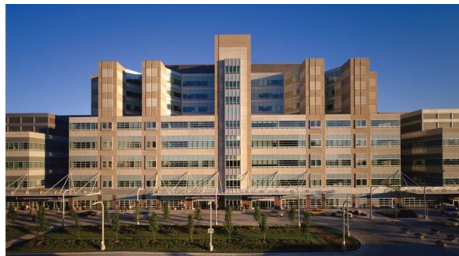
New Cook County Hospital (John H. Stroger, Jr. Hospital of Cook County)

RME was the structural engineer for the new OCC. The 25,000 sq. ft. and two four-story structures are connected by two three-story bridges.