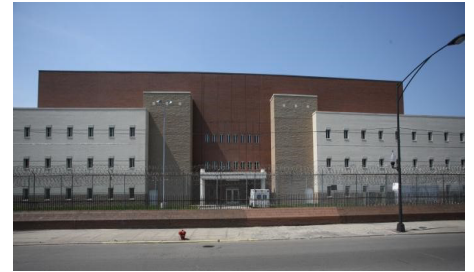
Cermak Health Services

RME, as part of the joint venture team, provided structural engineering design services of an approximately $551 million new hospital.