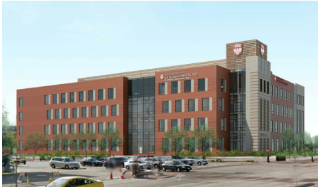
The University of Chicago Medicine Center for Advanced Care at Orland Park

RME has a strong reputation providing Structural/Civil + Construction Management engineering services for Healthcare facilities throughout the Chicagoland area. Our engineers have expertise and experience in new construction, exterior and interior renovation, additions, rehabilitation, inspections, studies and assessments. In addition, RME has navigated complex permitting issues including ADA upgrading and stormwater management.