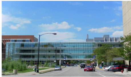
UIC - Outpatient Care Center

RME provided structural and civil engineering services for the renovation of Hines V. A. Hospital, including in-fill of existing interior courtyards to increase floor space.