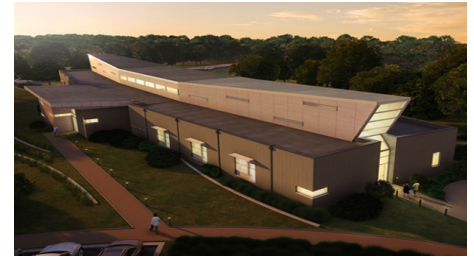
VA Danville Patient Pavilion

RME was the structural and civil engineer for this Facility to service 9,000 inmates at the Cook County Jail. This facility has a 150,000 s.f., free-standing 5-story concrete structure & basement building connected to the campus-wide tunnel system.