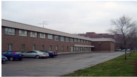
Evelyn Edwards Medical Center Renovation

RME provided structural engineering services for the design of a four-story, 108,000 sq ft clinical space for offices, examination rooms, and treatment facilities.